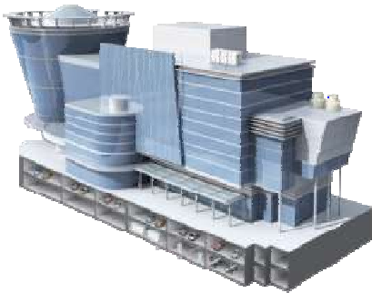
Commercial & Shopping Malls