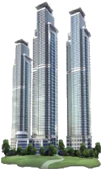
High Rise Apartments