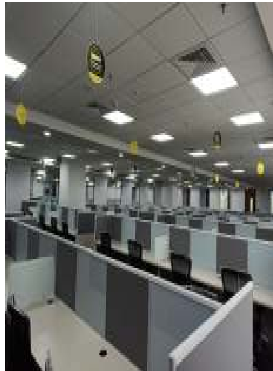
Comfort Air-Conditioning Systems