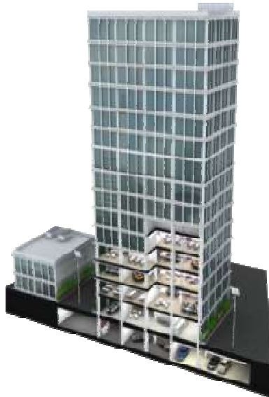
Office Buildings & Corporate office